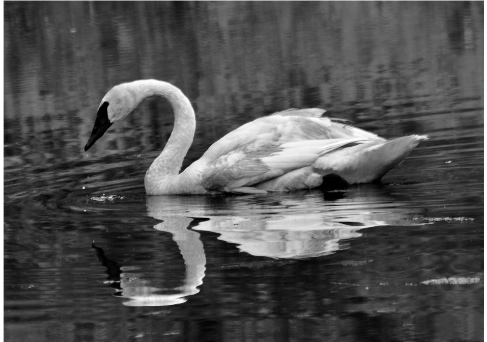
Camera Club Winner Theme : Black & White Photography by Gerry Royer