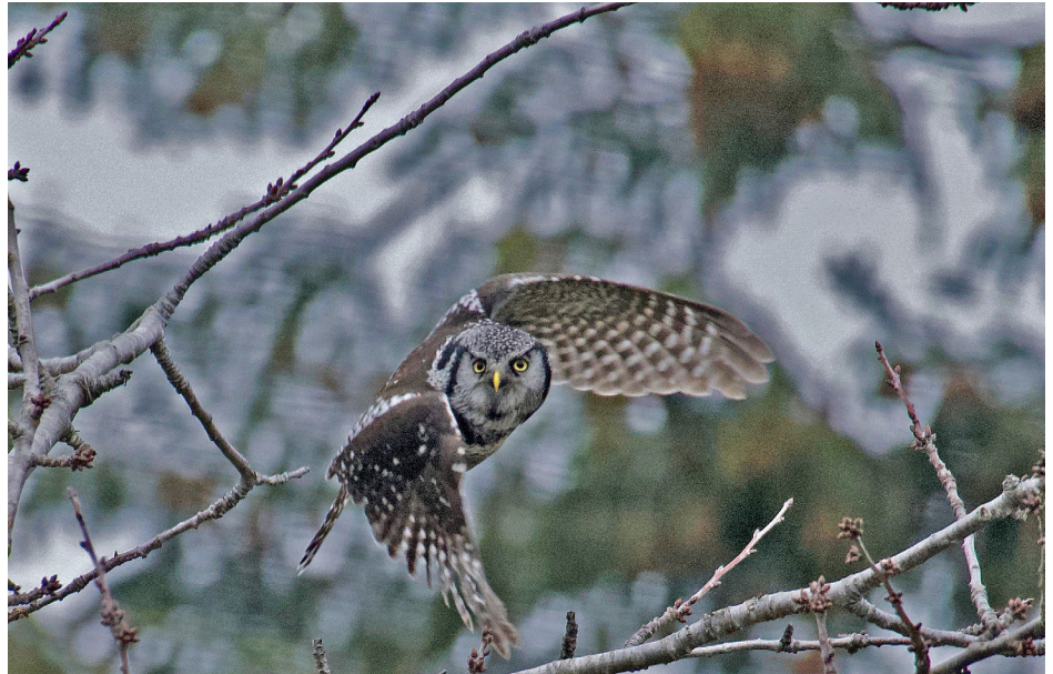
Camera Club Winner Theme : Close Up