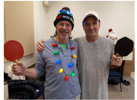
These guys were lighting up the room in December while playing table tennis and munching on Christmas treats.

Join us for a fun day of play on Mondays. Drop in anytime to play between 11:30-1:30 in the Rotary Room. Paddles and balls provided. Come out to see if this game is for you. First time free after which you must have an Evergreen Club Membership and pay a whole dollar for two hours of fun.