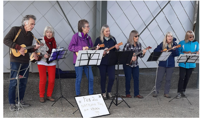
A small group of ukulele players from the Evergreen Ukulele Club thrilled folks at Marina Park with some lively tunes in celebration of International Play Your Ukulele Day February 2.