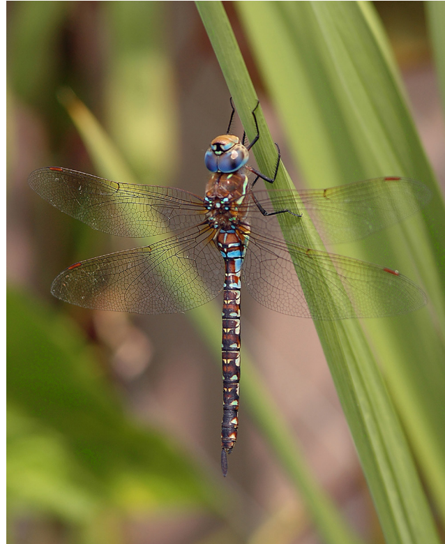
Camera Club Winner Theme : Close Up Photography by Mae MacKenzie