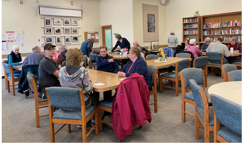
Euchre Players in the Evergreen Lounge on Thursday afternoons.