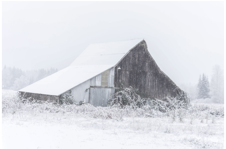
Camera Club Winner Abandoned Buildings